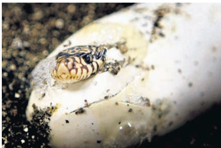
A baby Louisiana pinesnake poking its head out of its egg while hatching at the Memphis Zoo on July 8, 2010. The U.S. government says four areas in Louisiana and two in Texas should be protected as critical habitat for a rare snake that eats small gophers and takes over their burrows.

The company said in 2020 that state and federal biologists helped it identify two areas totaling about 2.8 square miles (7.25 square kilometers) as the most important for the snake. It said it would convert about 440 acres (180 hectares) from loblolly to longleaf pine and keep another 1,383 acres (560 hectares) with an open canopy and grassy forest floor. □